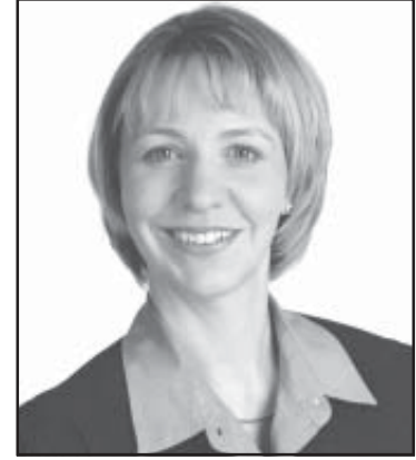
City Court Judge